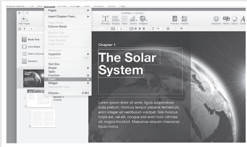
FIGURE 9.5: CREATE INTERACTIVE MULTIMEDIA E-BOOKS ON A MAC WITH IBOOKS AUTHOR.